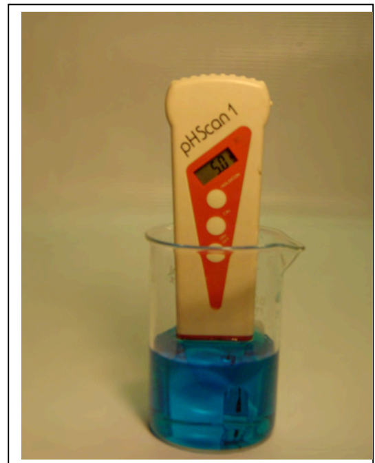
With Influence Spray Aide