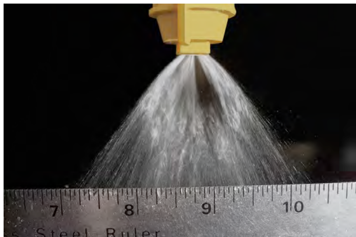
With Influence Spray Aide

Note great reduction of driftable off target fines.