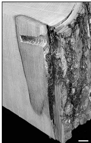
Figure 3. Stem injury from Arborjet injection in dissected sugar maple. Note the wound initiated discoloration and the imidacloprid residue. Scale bar = 10 cm.